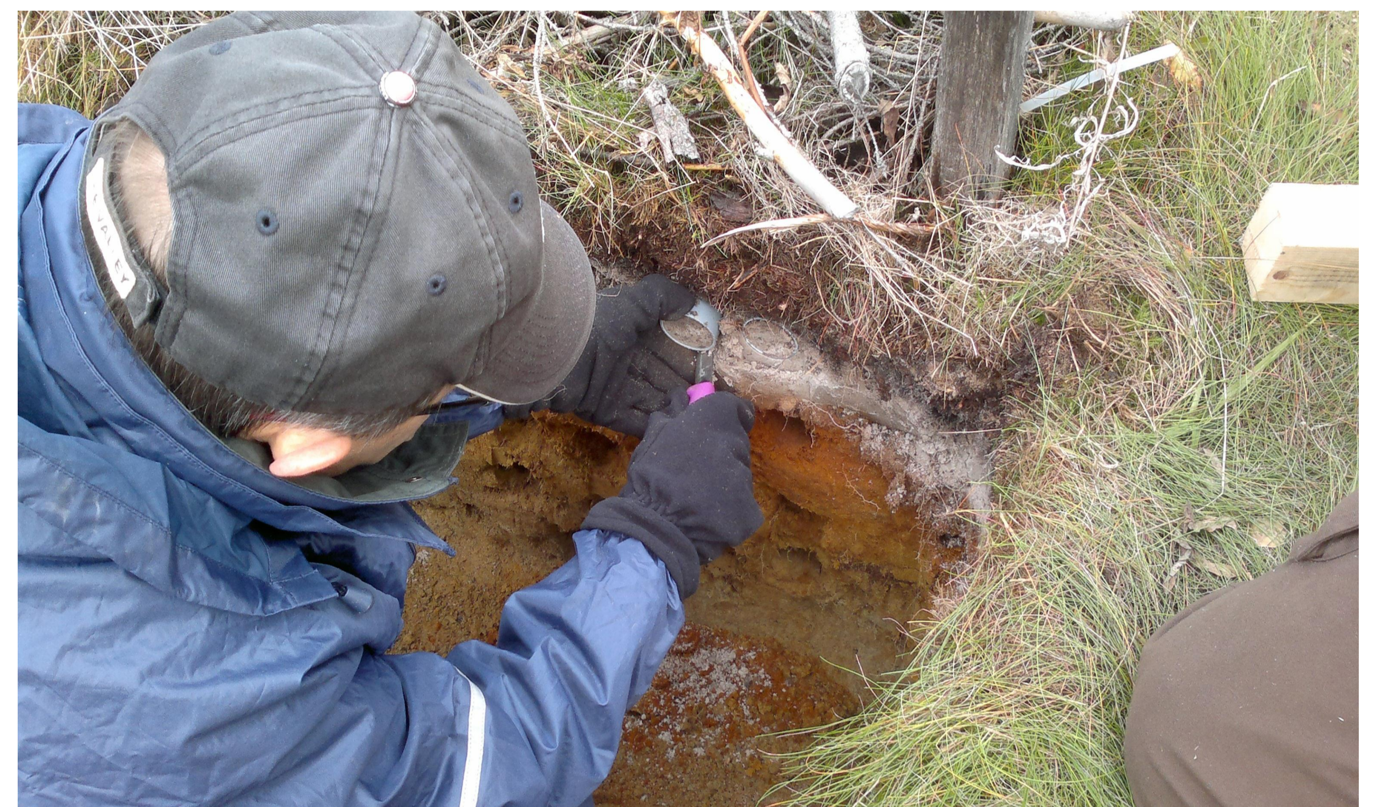
Fig.1. Soil samples were taken by soil horizons of the podzolic soil. There were 4 replicate samples for each soil horizon.

In conclusion, logging residues are important from the point of view of nutrient concentrations in soil solution even several years after the clear-cut.