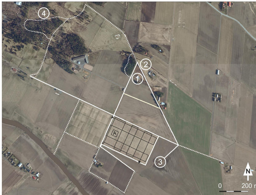
Figure 1. Aerial photograph of the study area. Letter A indicates the release area within the focal set-aside field. The black line with arrows indicates the 2500-m-long transect in which marked individuals were systematically searched. Solid white lines show the searching routes outside the release set-aside, and dashed white lines show the routes which were walked less frequently. Numbers 1–4 indicate favorable butterfly and moth habitats, which were used both for collecting individuals for the releases and for searching recaptures of emigrated individuals; especially sites 1 (abandoned farmyard and a sheltered forest edge) and 2 (semi-natural grassland patch) attracted many emigrants.

25 m × 25 m release area within a 11-ha set-aside field, which was established eight years earlier (Fig. 1; for the former six-year set-aside experiment, see Alanen et al. 2011). Movement distances of the marked individuals were then systematically recorded by recapturing them at different distances from the release area both within and outside the set-aside field (Fig. 1). This design enabled us to record distance moved and emigration rate in a comparable manner for a larger set of butterfly and moth species than to our knowledge in any previous study.