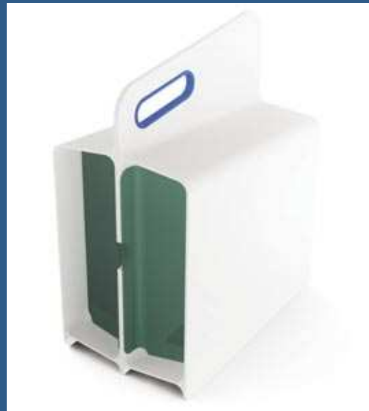
To design a 21st century nursing bag that will improve productivity and reduce transmission of infections

Theone Wilson explains how something as small as a bag could make a big difference in the NHS