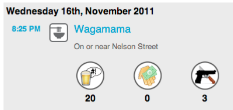
Figure 2. FearSquare application displaying anti-social, robbery and violent crime stats for a Foursquare check-in

The application then retrieves the 10 most recent check-in locations (figure 1) for that individual user and used the longitude and latitude of each check-in location to locate the relating street level crime statistics. The crime statistics that are presented to the user are that of crimes against a person and therefore the crime categories of; Anti-social behaviour, theft and violent crime were used (figure 2).