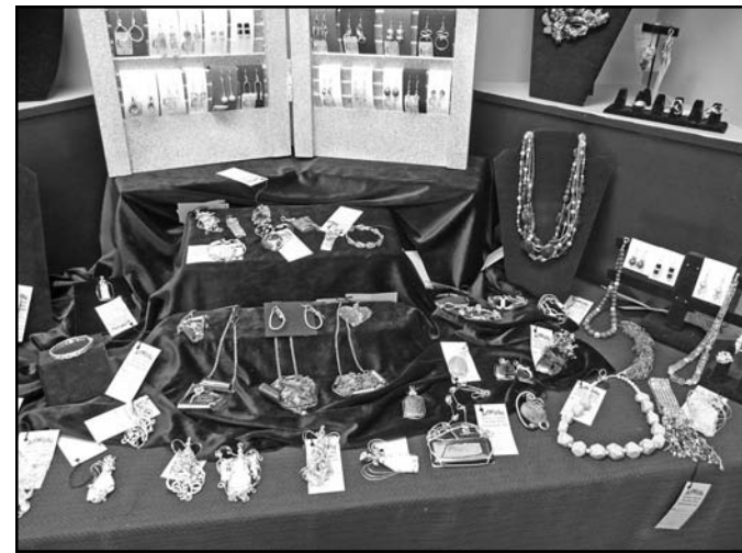
A true art lover can spot Evelyn Gantnier's work at first glance.