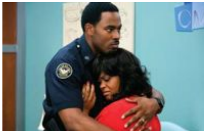
Image credits: This page: Somewhere . Opposite page: Top: For Colored Girls . Bottom: Rare Exports: A Christmas Tale .

Classic/ It's a Wonderful Life (U) Fri 17 – Thu 23 Dec