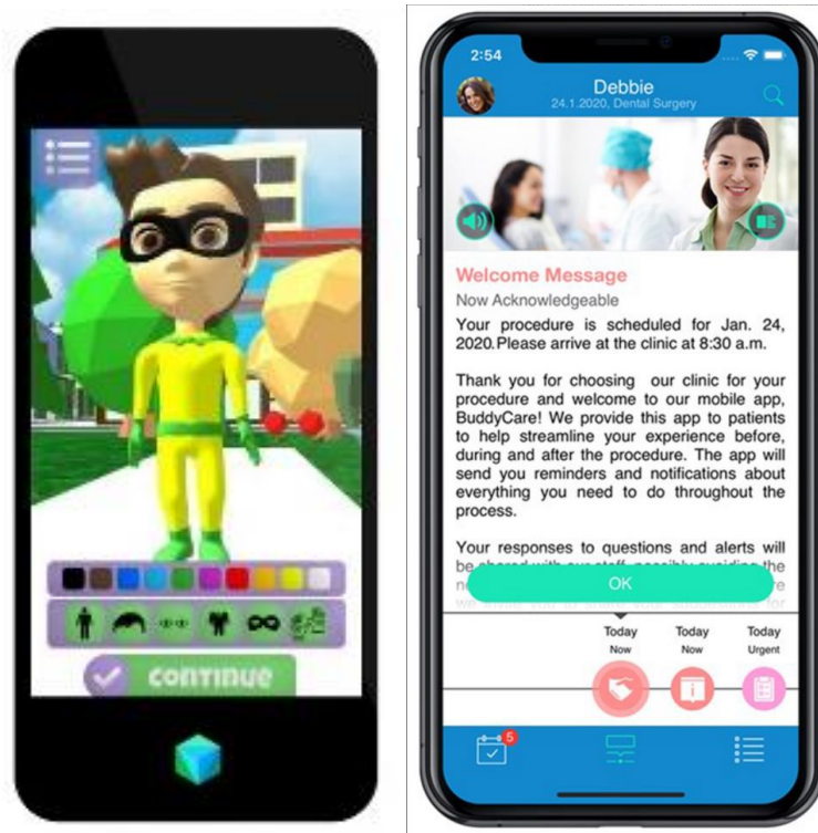
Figure 2. The gamified solution developed by Triumph Health (left) and the patient journey solution developed by Buddy Healthcare (right).

pediatric day surgery unit. Previously, patients with ear, nose, or throat operations were common, however during the pandemic, they disappeared almost completely. This was due to better hand hygiene and keeping mildly sick children at home.