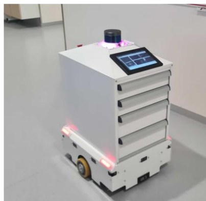
Figure 3. Solteq medicine delivery robot prototype in HUS