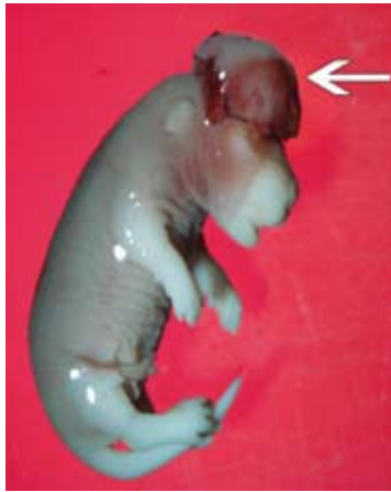
Figure 3 - A fetus with exencephaly (white arrow) from experimental group II, treated with 50 mg/kg/day gabapentin.