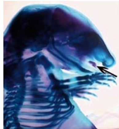
Figure 4 - A fetus skeleton with mandibular hypoplasia (black arrow) from experimental group II, treated with 50 mg/kg/day gabapentin, which has been stained with Alizarin red S-Alcian blue.