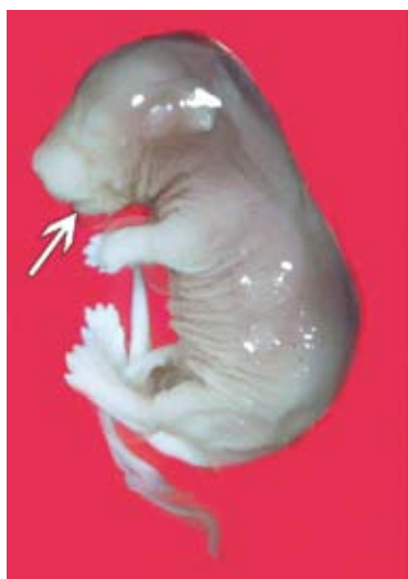
Figure 1 - A fetus with hypognathia (white arrow) from experimental group II, treated with 50 mg/kg/day gabapentin.