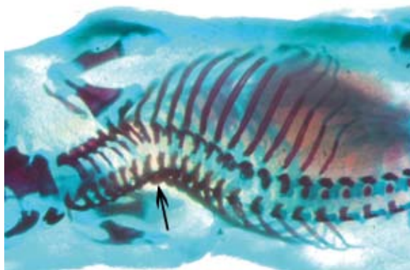
Figure 5 - A fetus skeleton with scoliosis from experimental group II, treated with 50 mg/kg/day gabapentin, which has been stained with Alizarin red S-Alcian blue.