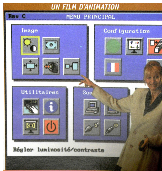
Illustration 3: Cliquet & al, 1998, p. 88.

For their part, women are rather represented in contexts linked to communication and to the new literacies defined by Leu, Kinzer, Coiro, & Cammack, (2004).