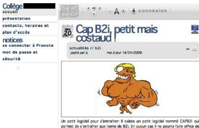
Illustration 4: Portal of a public collège

Several other kinds of portals do exist on the web, developed by schools, by associations, publishers and even by individual teachers. A huge diversity was observed between them, including regarding gender. For example, Illustration 3 has been found on the B2i portal of a public collège .