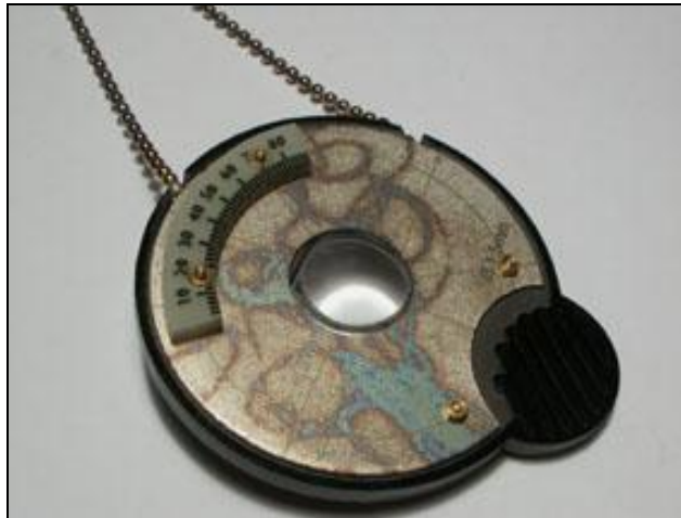
Figure 4: Ocular Series no 3 . Titanium marked in response to bitmap file in Fig. 3.

This series is based on the aesthetic of optical measuring equipment and relates to concepts of vision: ‘seeing the bigger picture’, ‘clouded vision’, ‘seeing through tinted glasses’.... This is emphasized by the observation of engineers in scientific research and their experiments that have in their own right become inspirational in my work.