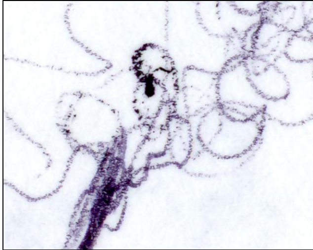
Figure 3: Drawing converted to bitmap.

This series is based on the aesthetic of optical measuring equipment and relates to concepts of vision: ‘seeing the bigger picture’, ‘clouded vision’, ‘seeing through tinted glasses’.... This is emphasized by the observation of engineers in scientific research and their experiments that have in their own right become inspirational in my work.