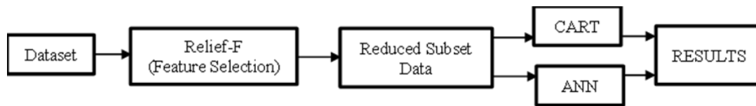
Figure 1. Customer churn prediction Approach using Relief-F with CART and ANN models

model includes information for each mobile subscriber from past calls, along with all the person and business information held by the provider of telecom services. Fully trained with the training dataset after the prediction model, the test dataset and the model have to be able to predict churners. Figure 1 shows the technique for the prediction of churners and the description of the steps proposed.