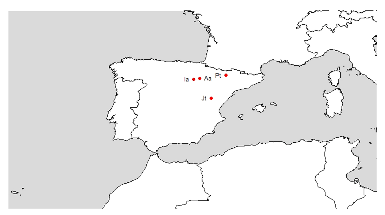
Fig. 1. Geographical distribution of the studied sites in Spain (Aa: Ailanthus altissima, Jt: Juniperus thurifera, Pt: Pistacia terebinthus, Ia: Ilex aquifolium).