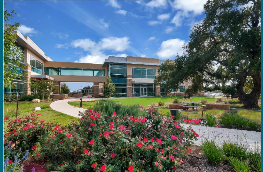
University of St. Augustine for Health Sciences (USAHS)