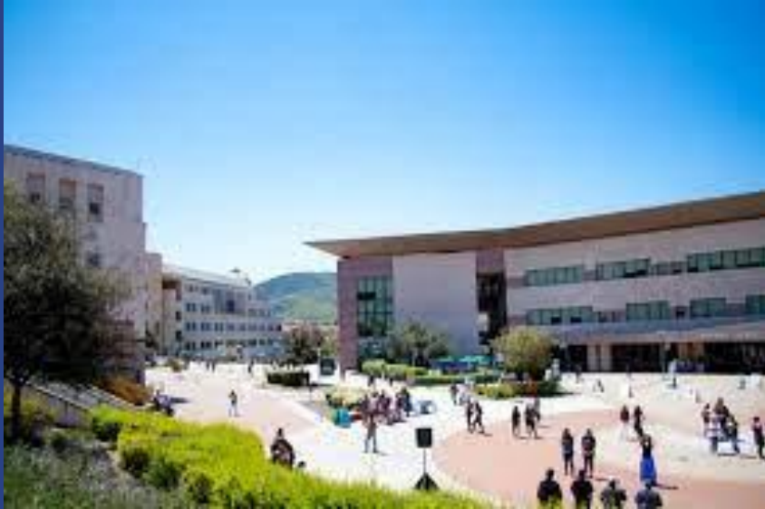
California State University, San Marcos (CSUSM)