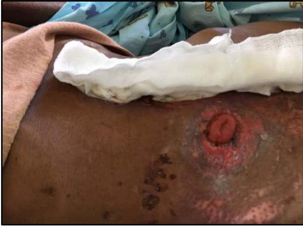
Figure 4: Improved peristomal wound; on postoperative day 7 the external stoma diversion was removed; significant improvement of peristomal skin maceration is noted.

anesthesia and does not require an anesthesia provider. It can be placed by a surgeon, general practitioner or surgical non-physician clinician. For this patient at postprocedure day 7, the proximal aspect of the condom becomes torn at the suture site, necessitating removal. Though at this stage of healing, the surrounding skin was improved and could accommodate traditional stoma bags, the patient and his family requested that the local general practitioner remove and replace the external stoma diversion using the same technique (Fig. 4).