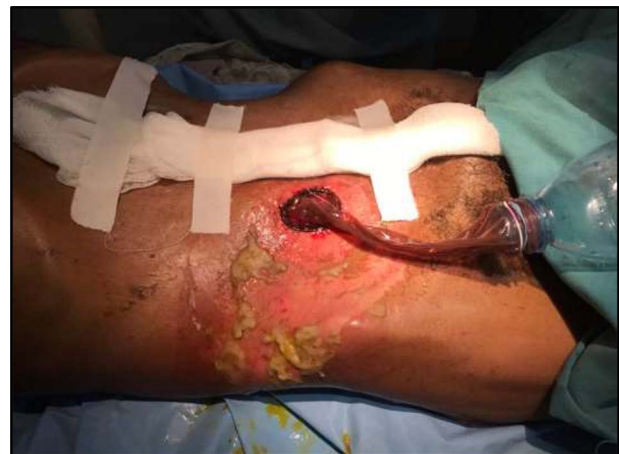
Figure 3: External stoma diversion; this image shows the external stoma diversion as applied in the patient setting.