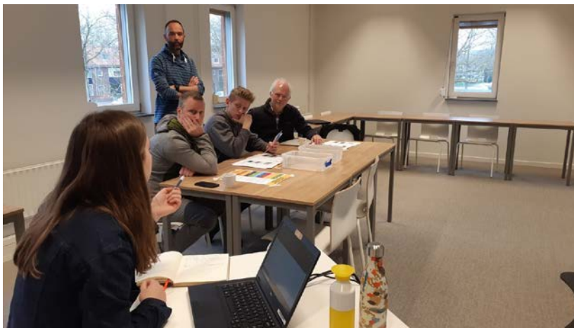
Figure 5: Presenting decisions to facilitator two

All 131 activities were assessed and in a closing discussion round finalised during this one-day session. We used a full description of most of the tourism activities created by (Praat, Sensagir, Goossen, Eijgelaar, & Peeters, 2020) as reference. The output of the assessment will be presented in the next section. Later some smaller issues were solved by the project leader in collaboration with those involved in the assessment session.