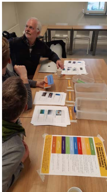
Figure 4: Experts assessing 1