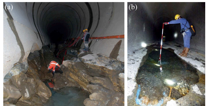
Fig. 3 Abrasion patterns at a) Palagnedra SBT, Switzerland and b) Asahi, Japan.

These tunnels, however, operate effectively despite the large abrasion. These abrasion problems cause high periodical maintenance costs additionally inhibiting the successful implementation on site.