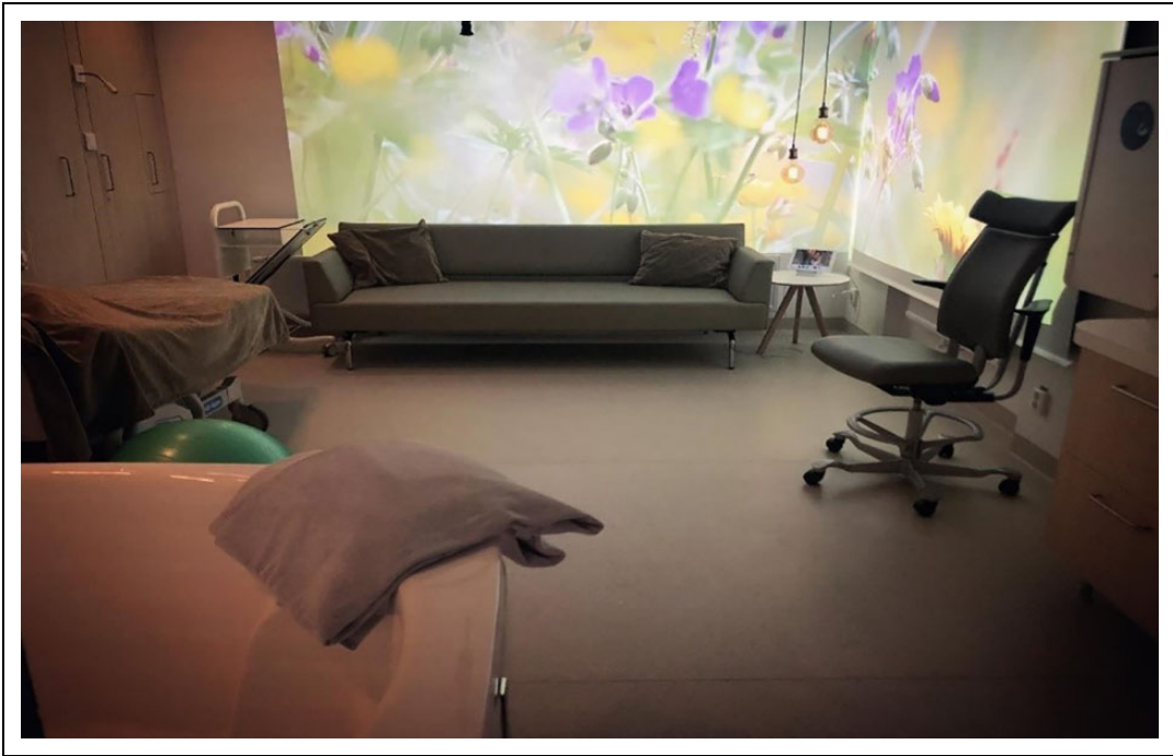
Figure 1. Part of the new room designed to be adaptable to birthing women's wishes and needs.