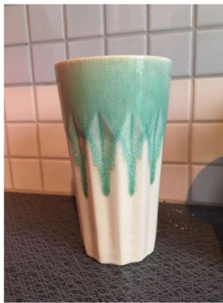
(a) “Something has been lost – my favourite cup has been lonely” (P7-M1)