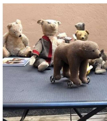
(b) “Leaving old ways of working behind and starting to work in new ways—it takes time” (P1-M1)