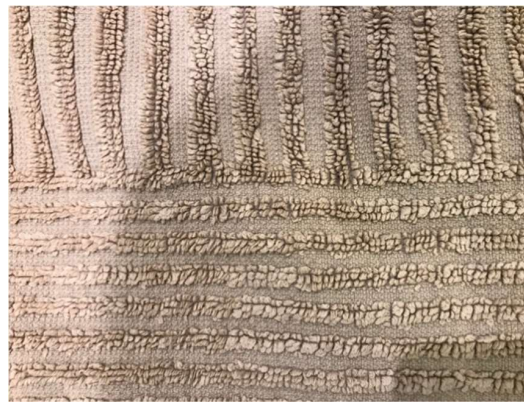
(b) “Everything goes in straight lines in online meetings, one always takes the fastest way, so we lose the nuance and simplify complex issues” (P6-M1)