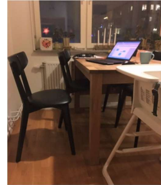
(b) “Ergonomic challenges with the home office” (P2-M1)