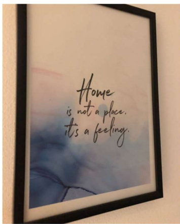
(a) “We have to strengthen the team and the ‘we feeling’ of shared culture and purpose” (P9-M1)