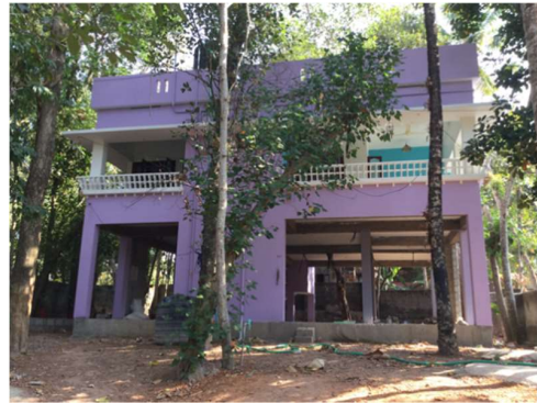
(a) “The possibility of working from anywhere—even from our family house in India” (P2-M1)

take advantage of a more expanded idea of the workplace in the future; for example, as described in Figure 5a: “We will use nature more as a room to work. We should create more flexibility, and work in the car, or in the parks, seeing the workplace as ever changing” (P4-M1).