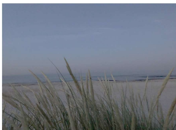
(a) “The wake-up call of pandemic, seeing opportunities to save natural resources” (P6-M1)

Remote work also helped increase individual productivity for many (especially those who had well-functioning home offices), due to fewer distractions and a stronger focus on goals and tasks in online collaboration and meetings. Many appreciated the time saved from not having to commute, which they used for things that were usually missing at work, such as (1) time for reflection and (2) integrating physical activities into workdays; for example, walking, jogging, or training during lunch breaks: “I get a lot of energy from working out at lunch time, and as a result, I can do a better job” (P5-M1). Other mentioned benefits were (3) spending more work time outdoors, for example for walk-and-talk meetings, and (4) more quality time with family and pets, making their daily routines easier: “No commuting time gives more quality time for my family and children. I have time to prepare food for the family already during the lunch break. I can be together and more present with my children in a way that I could not be before” (P2-M1). In addition to personal gains, remote work was mentioned as a contributor to a reduced carbon footprint, due to reduced commuting. The participants hoped that these new behaviours would stick and continue even after the pandemic restrictions ended (e.g., Figure 2a).