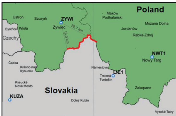
Figure 3: ASG-EUPOS reference stations (GUGIK 2022).

In this paper, each peak was measured by direct (field) measurements using dual-frequency GNSS receiver Leica GS16. On the peaks where a fix (precise) solution is available, RTK mode was used (six peaks) for three independent measurements of 30 s. Final altitude is a mean from these three values. In the case of obstructed view due to sky conditions and GSM signals, 1 h static GNSS measurements were made (six peaks). After that, in a post-processing using Leica Geo Office 8.4 (LGO) software altitudes were determined. On the peaks where the highest point was covered by trees or was impossible to lay on it GNSS antenna, an eccentric point (with good sky visibility), was established. With the use of geometric levelling, altitude differences between the top of the peak and eccentric point were determined. When GNSS was placed on the geodetic mark (Figure 5b) altitude was also reduced by height of the geodetic mark, to enable comparison with other measurements. In an RTK mode, the authors used the ASG-EUPOS ( http://www.asgeupos.pl ). On the selected territory, the nearest station was ZYWI (Zywiec, blue dot), located 18 km to 26.7 km from the selected mountain peaks (Figure 3).