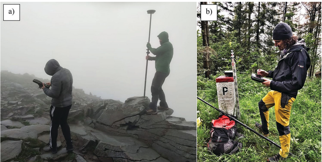
Figure 5: GNSS measurements at the Babia Góra (a) and the Jalowcowy Garb (b).

The measurement trip took place on June 23, 2020; measurements were performed by two independent field teams using three Leica GS16 receivers. The first stage was to reach the top of each mountain, select the highest point, and proceed with the RTK measurement, if the sky visibility was sufficient. If the fix solution was unavailable, static measurement was performed, or the eccentric point was determined. Figure 5 shows the weather conditions during RTK measurement at the Babia Góra (left) and on the Jalowcowy Garb (right). The time difference between measurements at those two points is only 2 hours.