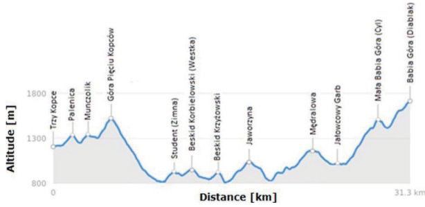
Figure 2: Profile of selected route of measurement.