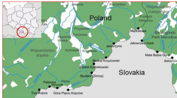
Figure 1: Mountain peaks (black dots) location on the Polish-Slovak border (Map layer from (GUGiK 2022).

Beskid Żywiecki is located in the south of Poland. It is the highest mountain group of the Polish Beskids and at the same time, the second-highest massif in the entire Western Carpathians (Solon et al. 2018). In this region, there are the peaks of Babia Góra and Pilska, the only ones in Western Beskids that rise above the forest line. This mountain range is made of sedimentary rocks known as flysch. Flysch is an alternating sequence of the grey colour of sandstones, and sometimes also conglomerates and clayey (Łoboz 2013). The selected 12 mountain peaks are located on the Polish-Slovak border in the Śląskie and Małopolskie voivodships (Figure 1, selected peaks – black dots).