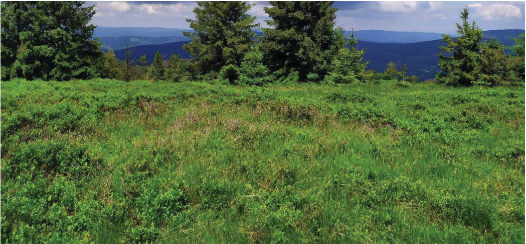
Figure 4: An ambiguous identifiable highest point in Mędralowa.

The levelling instrument was set between the potentially highest points, and the measurement was performed in the same way. Then, after analysing the obtained differences, the highest point was selected, and a static or RTK measurement was performed.