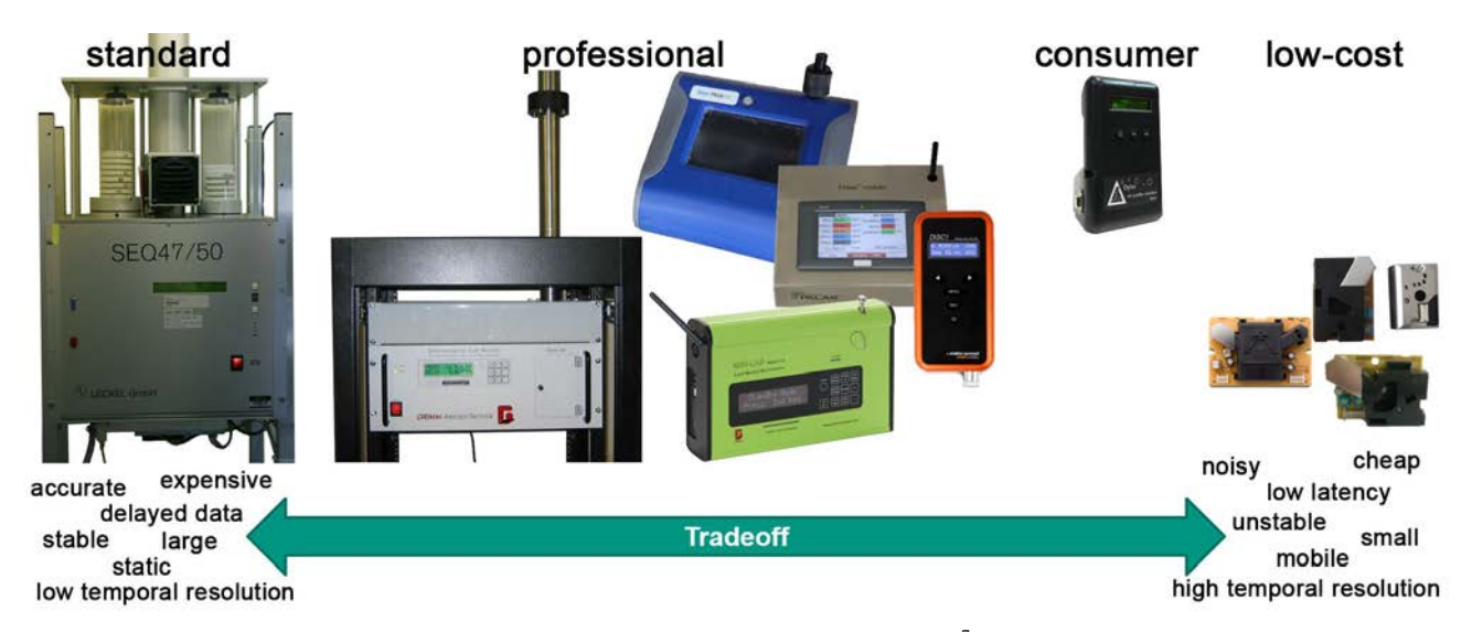
Figure 1. Range of measurement technology.

The main objective of this project is the development of an overall system for the recording, visualization and prediction of the spatial distribution of air pollutants in urban atmospheres that is relevant to the living environment of citizens. Existing data sources will be decisively supplemented by novel dynamic data sources. The "SmartAQnet" project aims to implement an intelligent, reproducible, finely-tuned (spatial, temporal), yet cost-effective air quality measuring network, initially in the model region of Augsburg, Germany. An overview of the full range of available measurement technologies is shown in Figure 1.