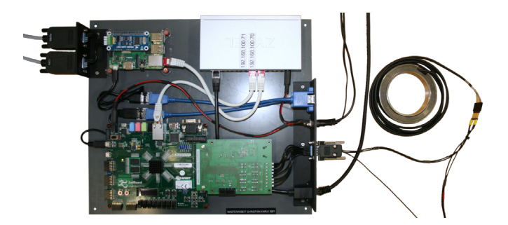
Fig. 3. Implementation prototype with CAN-based spindle sensor attached

was created, interfacing the analog digital converter on the PHY multiplexing board extension.