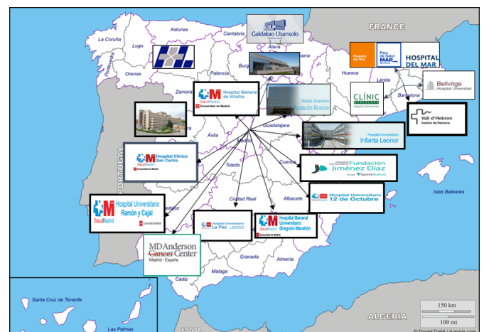
Figure 1 Distribution of Spanish Early-onset Colorectal Cancer Consortium participating centres across Spain.

The Spanish Early-onset Colorectal Cancer (SECO) cohort was established to collect high-quality data on individual-level characteristics using a questionnaire paired with biological fresh samples for molecular study. SECO started recruitment in January 2019, and to date has enrolled 220 patients with a pathologically confirmed CRC diagnosis before age 50 years. Inclusion criteria are patients diagnosed with CRC younger than age 50 years, no history of inflammatory bowel disease and a histopathological diagnosis of adenocarcinoma. Affiliated centres (n=18) enrolling patients into SECO are depicted in figure 1.