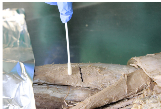
Fig. 2. Two areas of skeletal muscle comparable in size were labeled and one was covered using aluminum foil. Swabs were taken from both areas after UV-C irradiation. [Color figure can be viewed at wileyonlinelibrary.com ]

After exposition, the areas were probed with a fresh eSwab tip, prewetted with Amies transport medium,