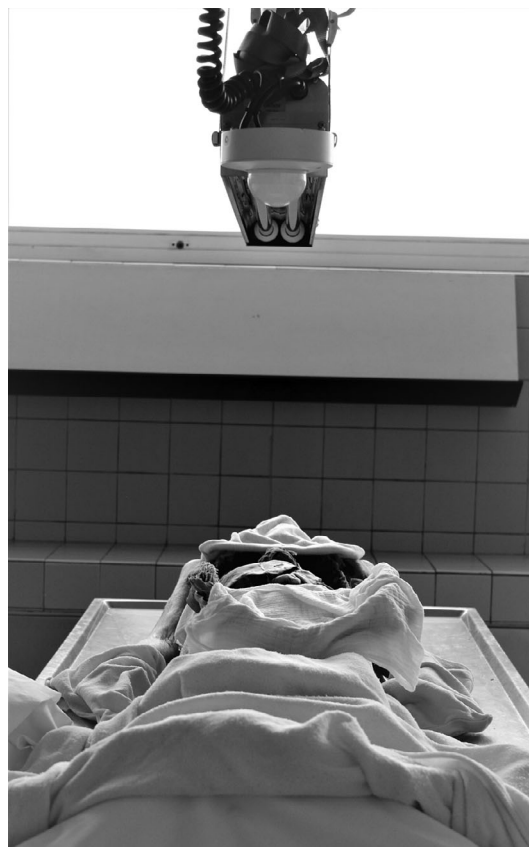
Fig. 1. An ultraviolet lamp mounted above a dissection table. Also visible is the motion detector that prevents irradiation of any person nearby.