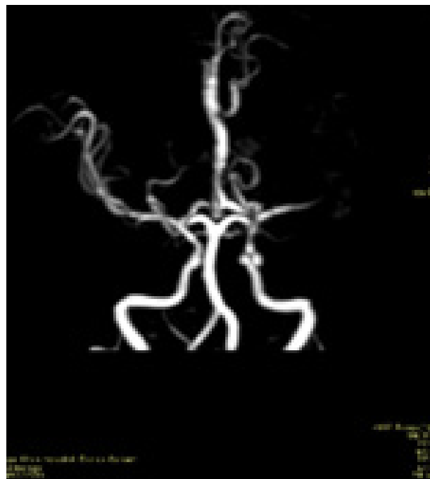
FIGURE 3. magnetic Resonant Angiography (MRA) of the Brain

gnificant residual neurological symptoms. This is similar to what is described in the literature with only about 35 % of patients making a complete recovery. Poorer outcomes are described in those diagnosed with late stages of disease. 1