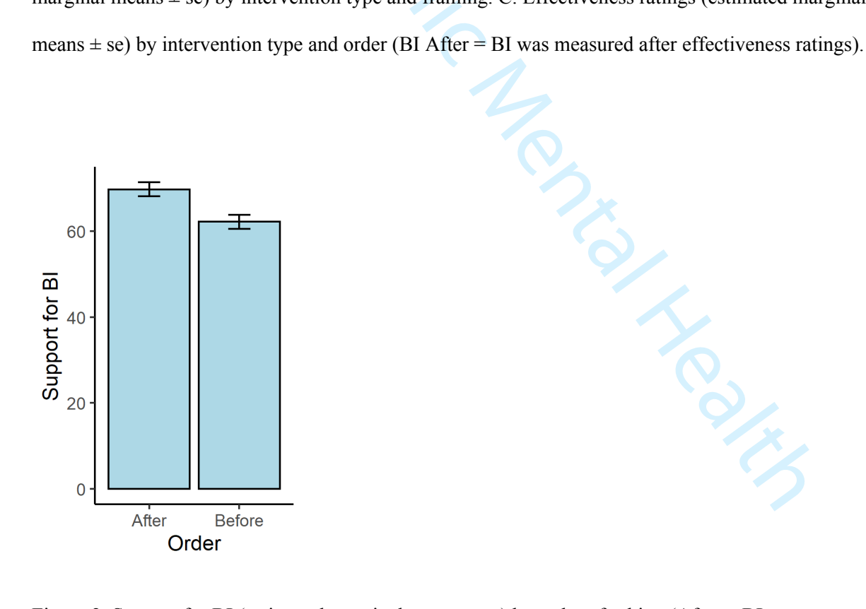
Figure 2. Support for BI (estimated marginal means \pm se) by order of asking (After = BI support was assessed after effectiveness ratings).