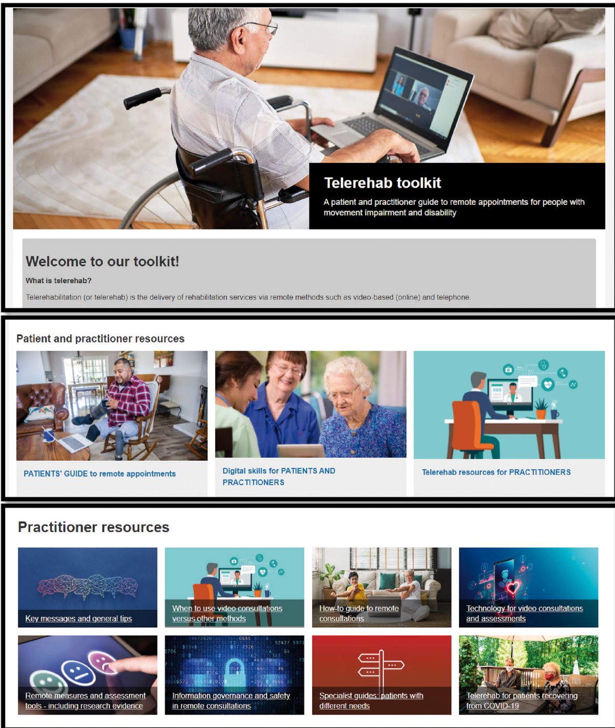
Figure 2. The Telerehab Toolkit.