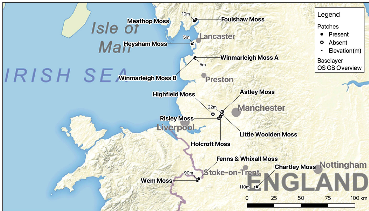
FIGURE 1 Map of habitat 'Patches' on peatland nature reserves in the northwest of England, UK, generated in QGIS. Patches are classified for Presence or Absence of Coenonympha tullia ssp. davus . Elevation above sea level is also shown. Reserves are low lying and mostly situated near sea level on the coastal plain between Liverpool and Lancaster. The five Absent Patches are on peatland restoration sites, remnants of an extensive area of closely related mires across Chat Moss and the Mersey valley

(Joy, 1991). Ovipositioning has been observed in the dry leaf litter below E. vaginatum tussocks (Melling, 1987; Wainwright, 2005). Cross-leaved heath Erica tetralix is predictive of C. tullia presence (Dennis & Eales, 1997; Dennis & Eales, 1999), and has been observed to be C. tullia 's most commonly visited nectar resource (Wainwright, 2005).