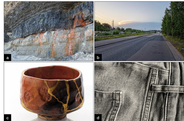
Figure 1: Examples of seams: a) naturally occurring coal seams within rock formations ; b) seams on a road caused by renewed asphalt concrete ; c) a broken bowl restored with the Japanese art of kintsugi, leaving visible seams between the broken pieces ; d) seams holding together layers of fabric.