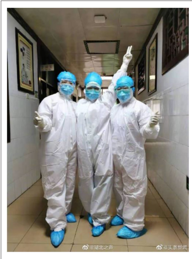
Figure 4. One of three photos posted with (e) ( Headline News , February 7th, 2020).

of the frontline healthcare workforce is represented. Of significance is the fact that a large number of news posts do in fact feature female medical workers as the main subject of the reporting, corresponding to the large proportion of women forming the frontline medical staff. At the same time, the representation often backgrounds the women's professional work, instead focussing on other non-professional spheres of their lives, revealing what can be interpreted as a clear patriarchal lens through which such reporting is framed.