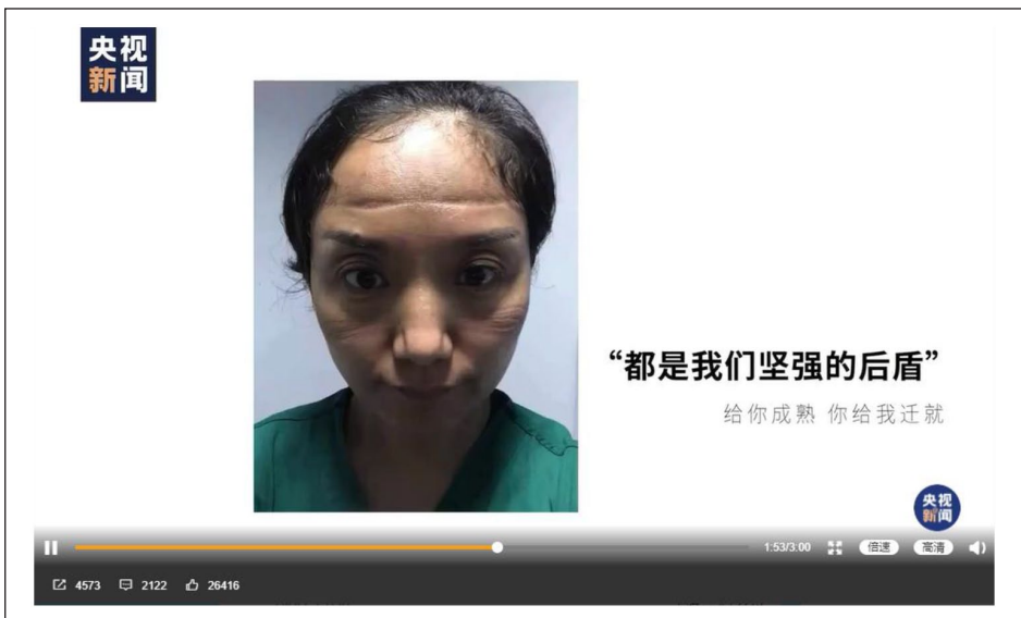
Figure 1. Screenshot of a video posted with (b) (CCTV News, February 1st, 2020) – text included in the screenshot translates to '[our family, government, hospital and leaders (from previous slide)] are all our strong backing' and 'provide you maturity, you give me compromise' [fragment of a song featured in the video].

Another context in which 'their faces' occurs is in descriptions of the female medical workers' faces as having been left bearing marks from the facemasks, as exemplified in (b). In this case, the female medical workers' appearance is again placed under scrutiny. Such representation is framed in a narrative of personal sacrifice, with the assumption that appearance forms an important part of female medical workers' personal interest but such personal interest is eclipsed by the greater good of the nation. Female medical workers were then positively evaluated for such a sacrifice (in (b), this is realised in 'the most beautiful in our eyes' – an evaluation of their appearances and virtues) and positioned as exemplary in these news posts. This focus on the women's appearance and its specific features is also visible in the video that accompanies (b), allowing for such representation to be further reinforced. Figure 1 (below) shows a still from this video, taken at a point in which a photo is displayed in the video. The photo forms part of a slide show of what appear to be non-professionally shot close-ups of the women's faces that bear the marks of long-term facemask use. The close-ups allow the viewer to establish a more intimate relationship with those depicted in the images (Caple, 2013), but also allows for