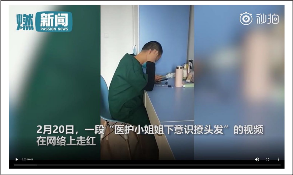
Figure 2. Screenshot of a video posted with (d) ( Headline News , February 20th, 2020) – text in the screenshot translates to: ‘On February 20th, a video of “a young girl medical worker unconsciously tried to pull her hair up” went viral’.