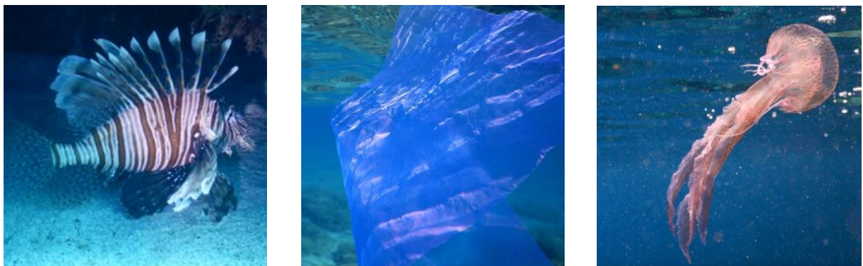
Figure 1: Examples of database images.

In this study, classes are defined as follows: an image which has man-made debris in it ('Litter' or '1'), or it has natural aquatic life in it ('Animals' or '0'), this class can include plants or any variety of marine biology.