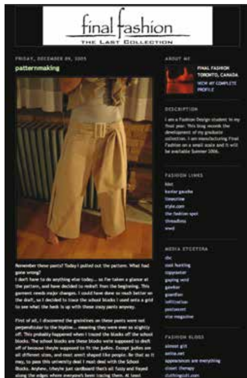
Figure 1 Screenshot of “patternmaking” post, Final Fashion , December 9, 2005.

The fashion blogosphere of this time was characterized by long-form written posts, only rarely punctuated by images. Such a blogosphere is hard to imagine for a contemporary fashion blogger, as original, high-resolution images are a cornerstone of the two most popular fashion