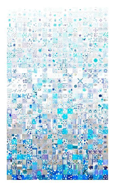
Figure 2. An example of the snow-firn-ice profile, or "global ice core" generated from the global submissions. Image created by the author Heidi Roop in collaboration with Dan Zwartz.

supplementary information and videos, and (b) an art activity that asked students to draw the three different "phases" of ice formation, including snow (flakes), firn (blobs), and ice (bubbles). The students' images were then submitted to a dedicated email address and were processed by a computer code written by [15]. This program collated the images by color density and automatically sorted the numerous submissions into a visual snow-firn-ice or "global ice core" image (Figure 2). Polar-themed mosaic images were also produced and participants were encouraged to produce and share their own mosaics using online freeware (Figure 3). The submitted images and mosaics were shared online and through the APECS and IPW partners' webpages.