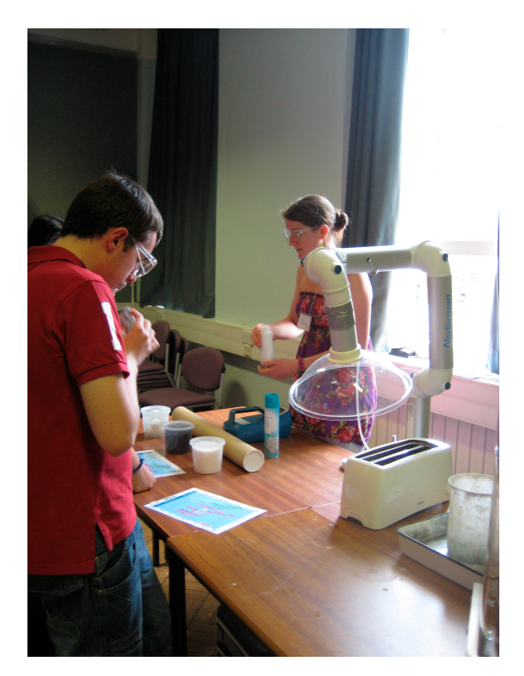
Figure 1. Students learn about aerosols in the atmosphere.

were between 30 and 40, and there were usually between 5 and 6 different activities, depending on the number of students. An example of one of these activities is shown in Figure 1.