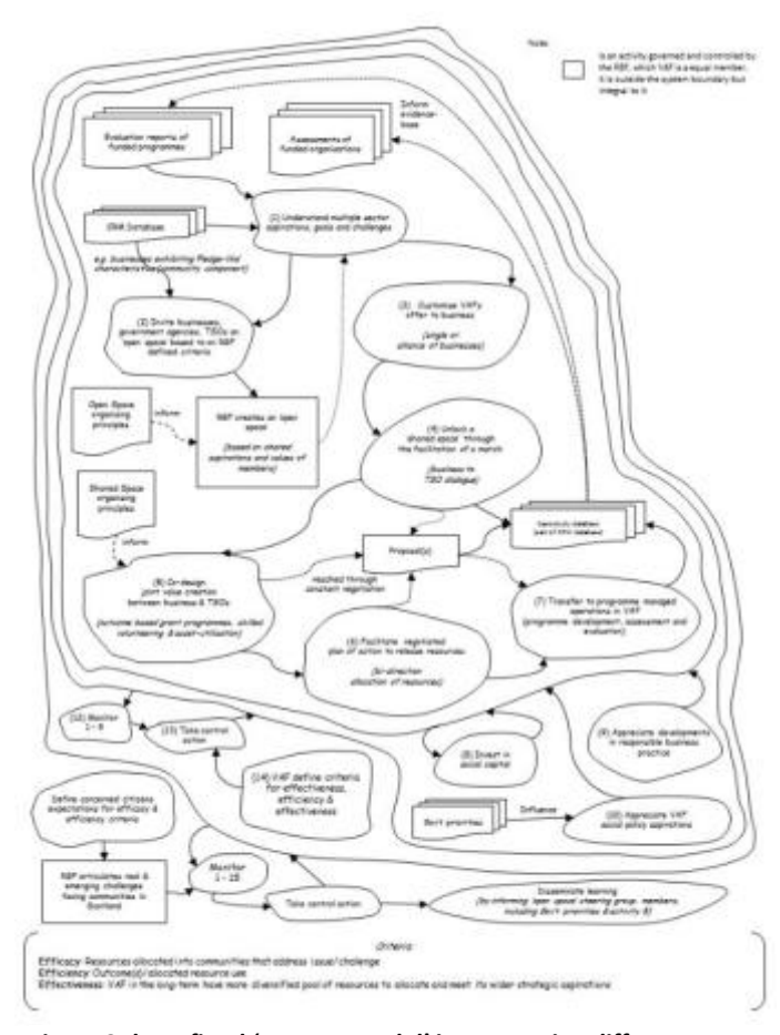
Figure 3 the refined 'connect model' incorporating different perspectives learnt in cycles 1 - 3

This study, to date, has provided a "flipped view" of responsible business practice from the perspective of government and the third sector rather than a typical corporate version of the way in which businesses see themselves and their role in society. This 'flipped view' is reinforced by a CF (a fund manager) who suggested that the "focus"