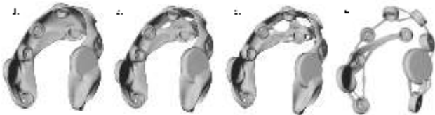
Figure 3. Generative design solutions. 1: PET plastic (0.22kg, 3D printing), 2: Acrylic (0.17kg, 3D printing), 3: ABS plastic (0.14kg, 3D printing), ABS (0.14kg, unrestricted manufacture).