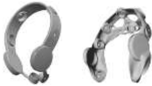
Figure 2. CAD model (left) and the initial generative test headset (right).

Figure 2 shows an example of the generative process, starting from a single headset band and resulting in an optimised geometry. Varying the headset plastic material resulted in different design solutions shown in Figure 3. All design options can withstand the loading conditions and the chosen design, made from ABS plastic, consisted of the least material mass (Fig 3, option 3). ABS was the plastic material of choice due to its high strength to weight ratio. Additionally, there was an ‘unrestricted manufacture’ design option 4 also made from ABS, however this wasn’t chosen as rapid prototyping was the manufacturing method of choice based on ease and cost of manufacture [6].