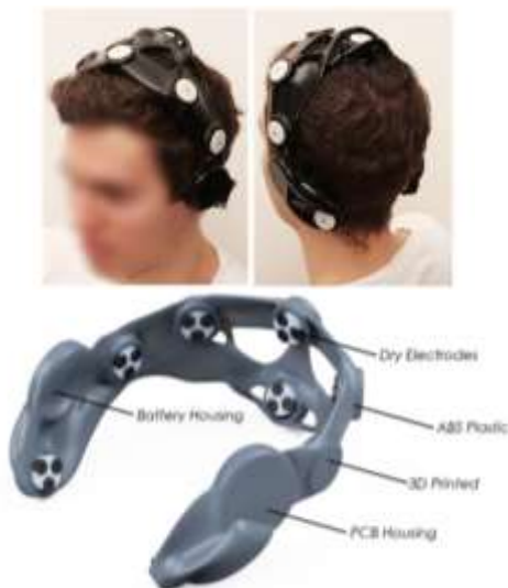
Figure 4. 3D printed Generative model with electronic components included.

The model was 3D printed in ABS plastic to incorporate the electronic components and test the headset. The geometry of the chosen design is shown in Figure 4. These dimensions were based on one individual head but can simply be modified to any head shape dimensions, by re-running the generative software with a different head model.