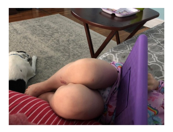
Figure 6: No privacy or personal space [52]

She continued on to describe her selection of photo: