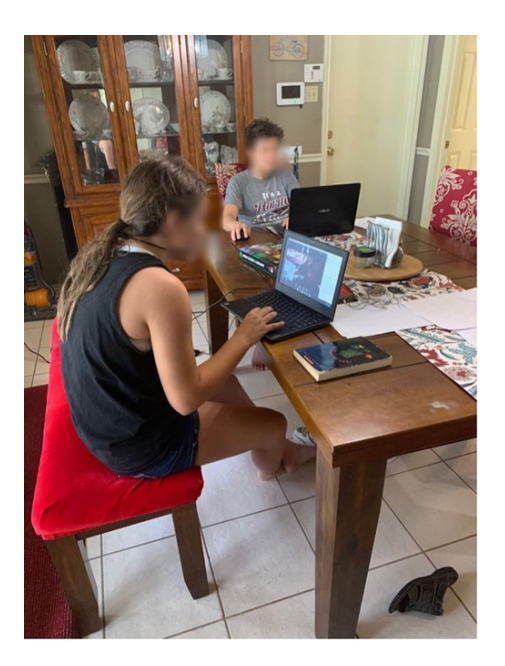
Figure 2: Shared dining table and work space [47]

These comments provided important insight connected to how emancipatory research can work. Such feedback can help lead to policy outcomes that could affect socially-just changes for motherscholars.