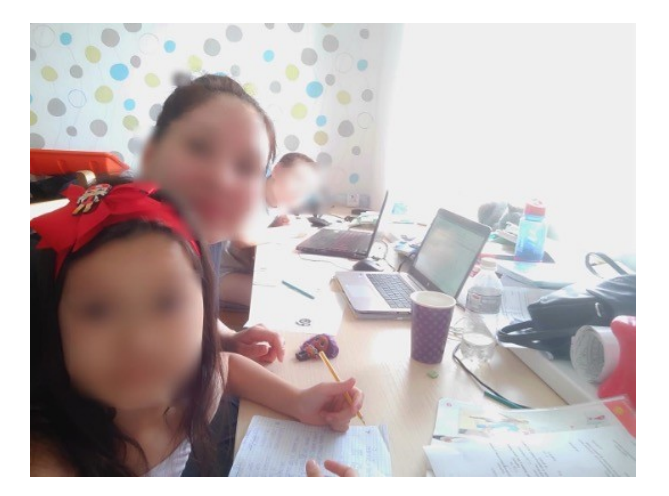
Figure 5: Studying and working simultaneously [51]

I hope the university and policy makers will understand the difficulties of motherscholars and implement some policies for improvement, provide funding for supporting mothers."