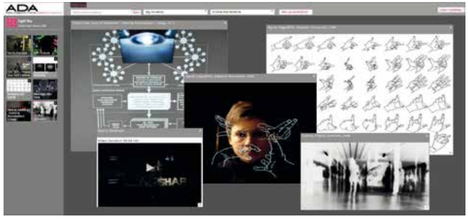
Fig. 1. Archive of Digital Art, screenshot (detail, Community Light-Box) <a href="https://www.digitalartarchive.at/nc/home.html">https://www.digitalartarchive.at/nc/home.html</a>, accessed 4 March 2018.

Since the year 2000, ADA is one of the most complex research-oriented resources available online as a platform for both scientific information and social communication. Hundreds of leading Media Artists are represented by several thousand documents, with more than 3,500 articles and a survey of 750 institutions of media art also listed. Besides the artists, there are also more than 250 theorists and media art historians involved in making ADA a collective archiving project (Fig. 1).