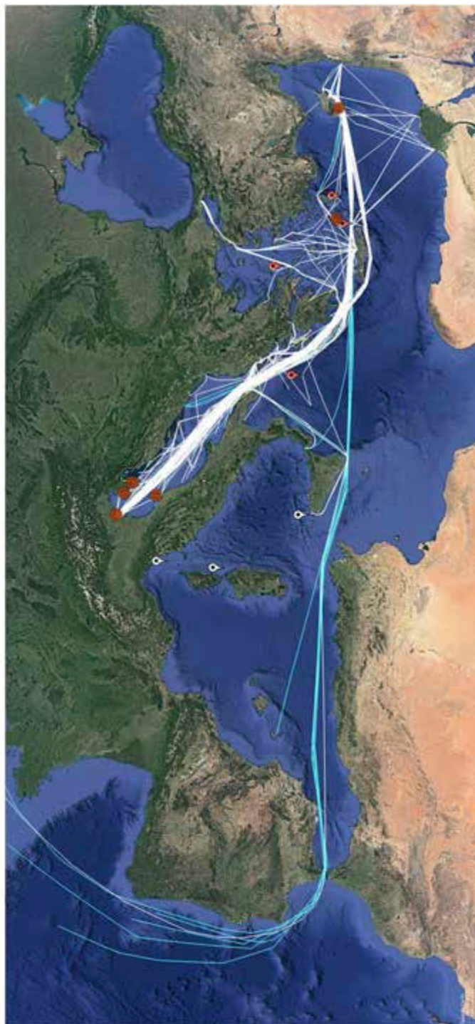
Map. 2. Venetian shipping trajectory compilation for the year 1514