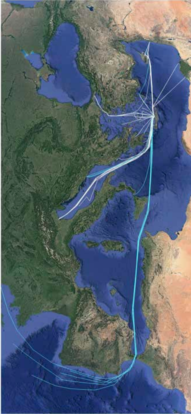
Map. 3. A trajectory map visualizing maritime traffic flows in the port of Candia (Crete) for the year 1514