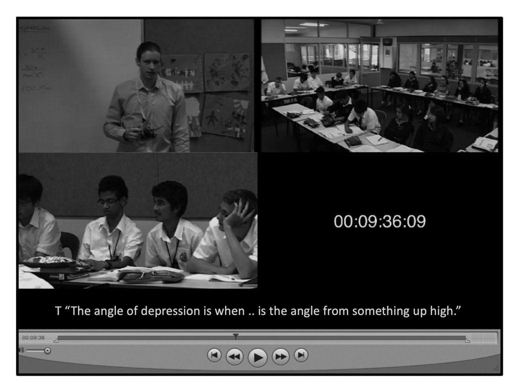
FIGURE 1.1 Video material re-packaged into a single viewing window (illustrative only).