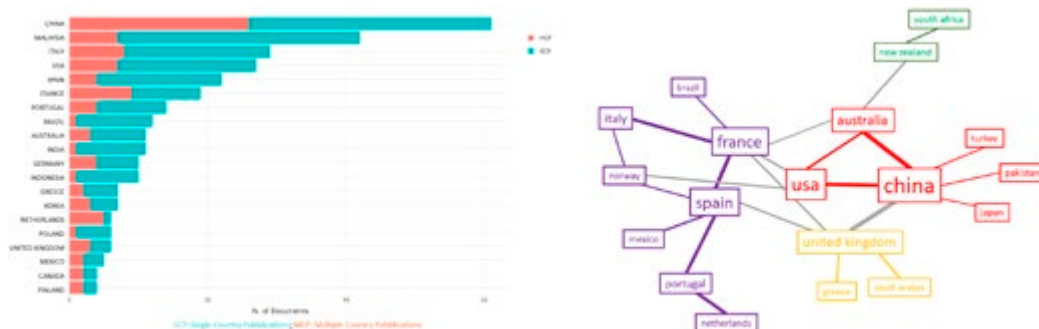
Figure 3: Country production and country collaboration networks

As regards provenance, the research activity of countries in terms of their publication output on this theme was examined. Figure 3 shows the top 20 most productive countries in terms of publication output and scientific collaborations during the period 2008-2020. In particular, the left-hand side of the Figure 3 shows the number of articles produced by the authors of different countries and the rate of cooperation of each country’s authors with those of other countries, while the right-hand side of the Figure 3 shows the cooperations and networking among researchers working on and studying this subject in different countries.