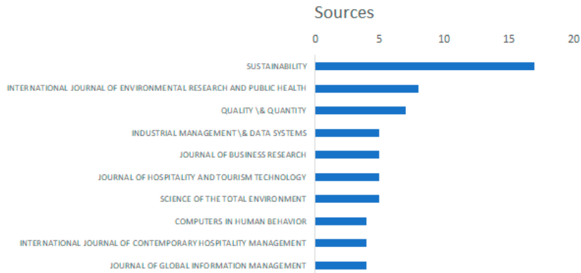
Figure 2: The most relevant sources

Concerning the sources, the distribution of the articles does not present any significant concentration. The journals which included the most frequently quoted articles, containing “decision making” and “PLS-PM” as keywords, are presented in Figure 2, with the largest number of articles, namely 17, published in the Sustainability journal, followed by the International journal of environmental research and public health , a journal which deals with issues related to environmental health sciences and public health, measurement and monitoring models.