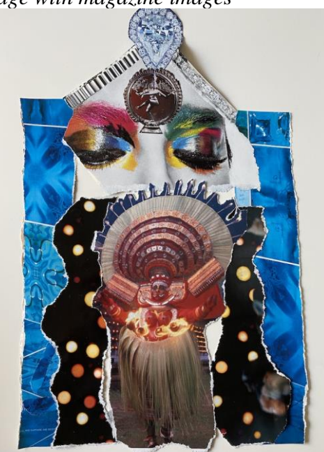
Collage as a Vehicle towards Integral Consciousness

In postmodern art, collage is an aesthetic device that juxtaposes textual and visual elements that creates an awareness of the experience of viewing (Aronson 1991). It allows for the multiple overlapping of papers