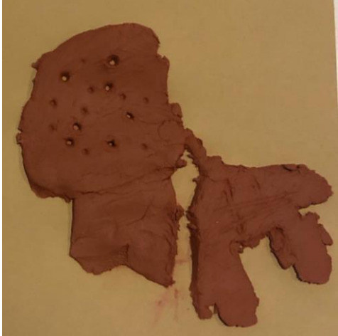
Using Clay to Conjure Magic

Clay is a material that facilitates the expression of emotions, particularly rich and complex emotions (Henley, 2002). Clay can welcome emotions and stories that were previously inaccessible to the client's consciousness; it may be that the magical qualities of clay support access to experiences that happened during the preoperational period. It has been documented that clay facilitates both catharsis and regression (Henley, 2002). Hence clay is proposed as a medium that can enable access to the magical structure. Clay can help circumvent the conscious defenses and create direct access to different aspects of the mind. After the clay has been formed, it