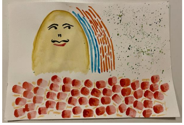
Watercolor on paper