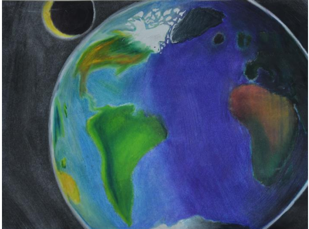
Pencil Drawing to Access the Mental Consciousness

Get a pencil, an eraser, and a sharpener and assess your response. Are you ready to explore and find answers? To follow formulas and get answers? Drawing, specifically with pencils, seems to awaken the mental consciousness where we feel we can be objective and separated from our subjective experience. Once we create the drawing, it becomes an object separated from our self. An object that, in its accuracy, conveys the values of reasoning and logic. Science uses drawing to step away from magic and myth and find formulas. Drawing invites us to be primarily rational. To create art as a statement of our ability to reason and depict the external world accurately. In the an excessive mental case of Luis, consciousness, conveyed through his love for pencils, supported his internal fragmentation.