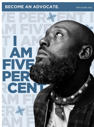
“Five Percent” 2021 18”x24” Digital Media