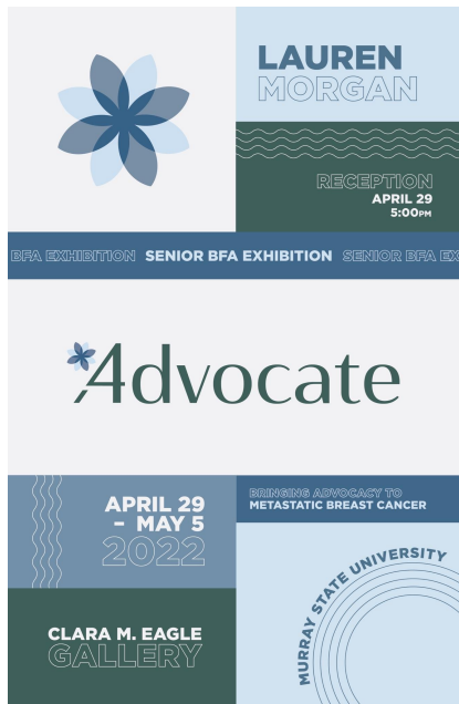
"Show Poster" 2022 11x17 & 6x4 Digital Media