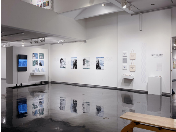
"Gallery Images" 2022 Digital Media