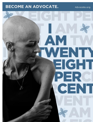
“Twenty-Eight Percent” 2022 18”x24” Digital Media