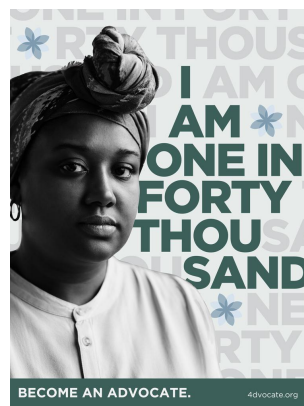
“One in Forty Thousand” 2022 18”x24” Digital Media