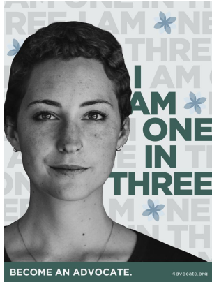
“One in Three” 2021 18”x24” Digital Media