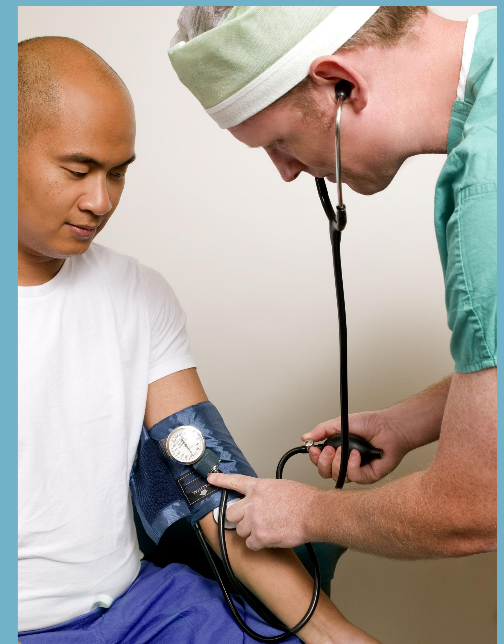
Prop 187 removed both the motivation and resources for immigrants to get medical treatment for TB.