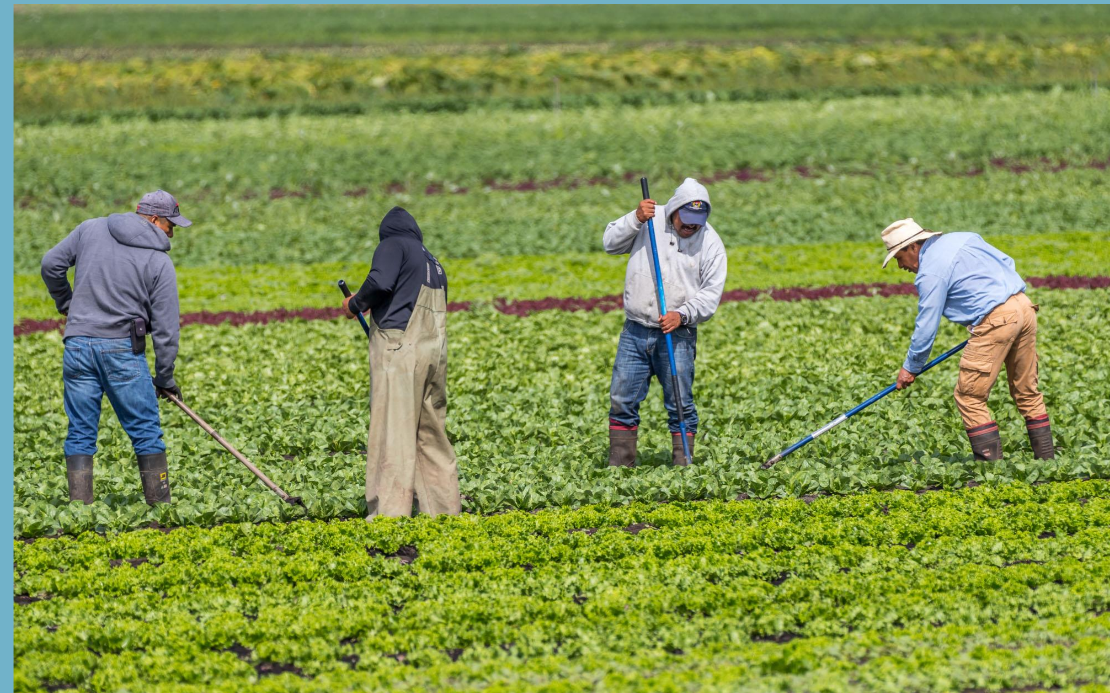
Illegal immigrants working in fields can spread tuberculosis to others.