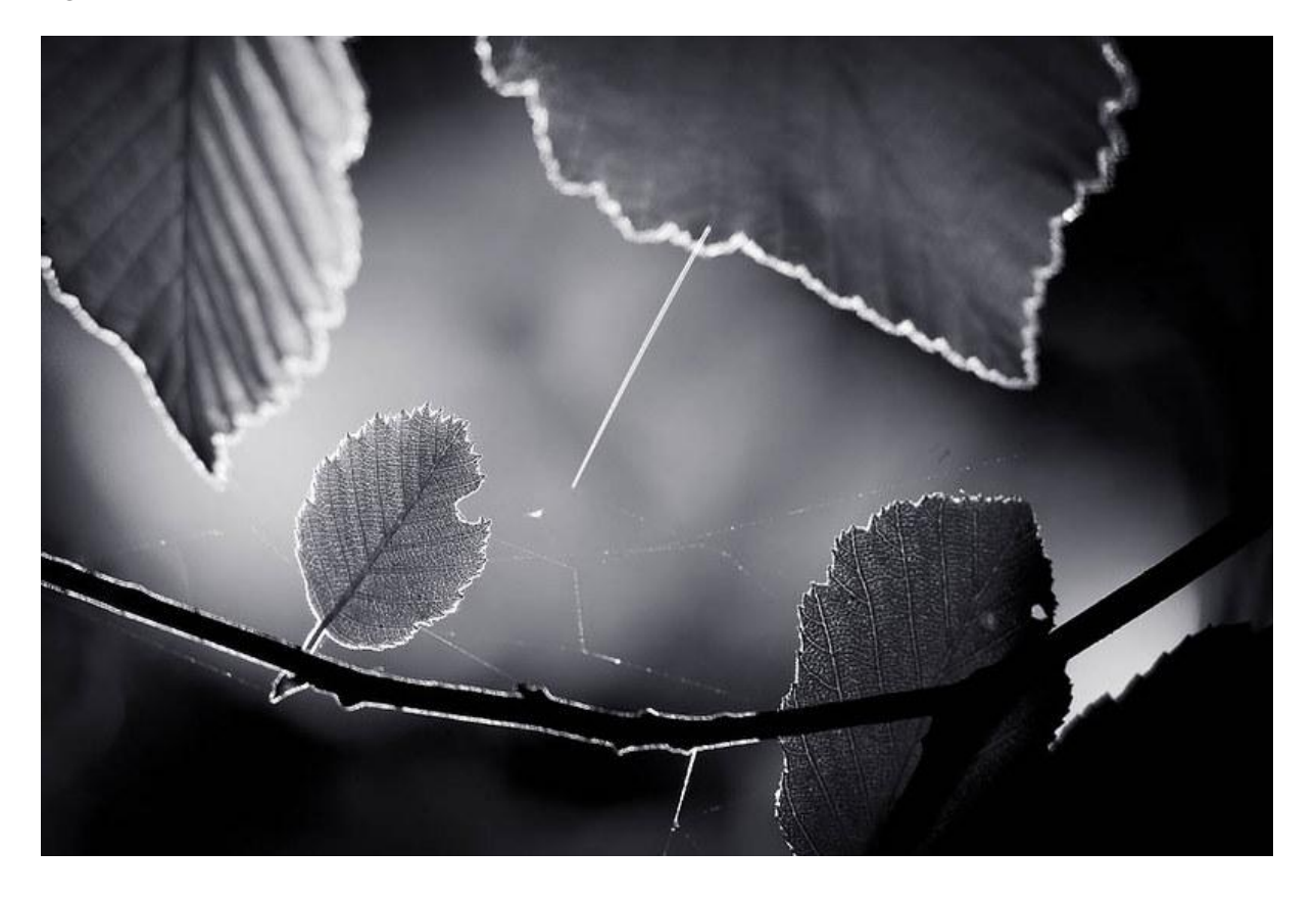
"communication" by flavijus is marked with CC BY-NC-ND 2.0.