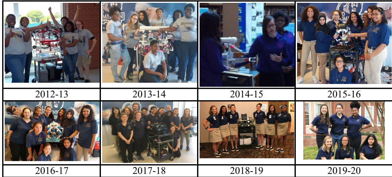
Table 1: Different generations of Girls in Engineering teams [15]

Some of the main activities pursued by the school in order to increase the engagement of high school students in engineering were: