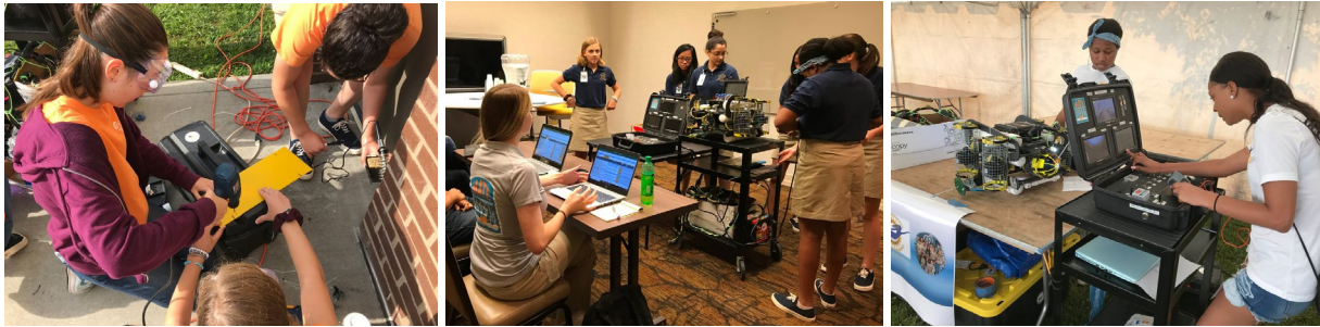
Figure 1: Girls in Engineering participated in various hands-on activities while designing, building, testing and programming underwater autonomous robots

Center uses underwater robots – also known as remotely operated vehicles or ROVs – to teach science, technology, engineering, and math (STEM) and prepare students for technical careers.