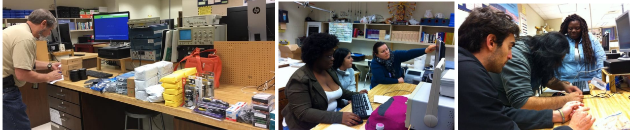
Figure 5: Various equipment was purchased through grant funding to support CTE instruction

different cities of this metropolitan area. Educational modules and Arduino Sparkfun Inventor kits were distributed to CTE teachers and collaboration among Engineering Studies courses and Girls and Engineering Courses continued. The second grant obtained funding from the Office of Naval Research, for a STEM program named “Higher Education Pathways for Maritime Mechatronics Technicians (MechTech)” which started in 2015 [20]. As a part of this grant, various equipment was purchased for the CTE classroom: Arduino kits, VEX robots, Sumo robots, and various controls and electronics equipment to support Girls in Engineering programs - $6,000 annually for three years.