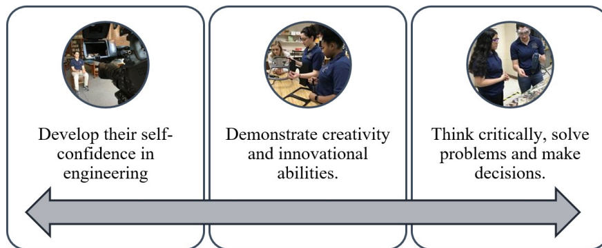
Figure 2: The main goals of Girls in Engineering program

The “Girls In Engineering ” program was designed to: 1) Develop their self-confidence in engineering; 2) Demonstrate creativity and innovation abilities; and 3) Think critically, solve problems, and make decisions.