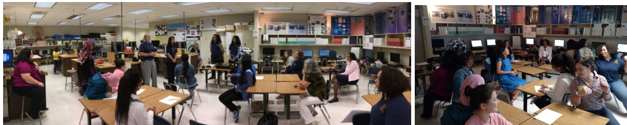
Figure 3: Meet and greet annual event in which girls presented their ROV designs to women mentors (engineering professors and Society of Women Engineers (SWE) student members)

and receive advice from the school instructors about the applicability and outcomes of this opportunity, as well as the support and encouragement to apply.