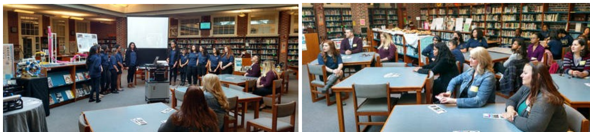
Figure 4: Lunch and Learn annual event in which students from Girls in Engineering program presented their ROV designs to STEM women mentors and invited audience

“Lunch and Learn” is another event that was held annually in the high school library. CTE students from the culinary department of the same high school would provide catering. The high school students would present their team and their robot design to the audience of engineering faculty, engineering professionals, and other STEM related professionals. Thereby, girls practiced public speaking and their networking skills.