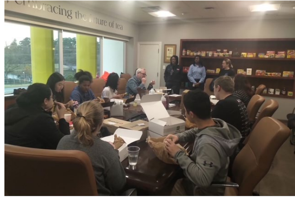
Figure 9: a) Granby High Schools students watching the presentation about different products at Unilever Lipton plant in Suffolk, VA; b) Granby High School students (5 Girls in Engineering and 5 male students) learning from female engineers about their job