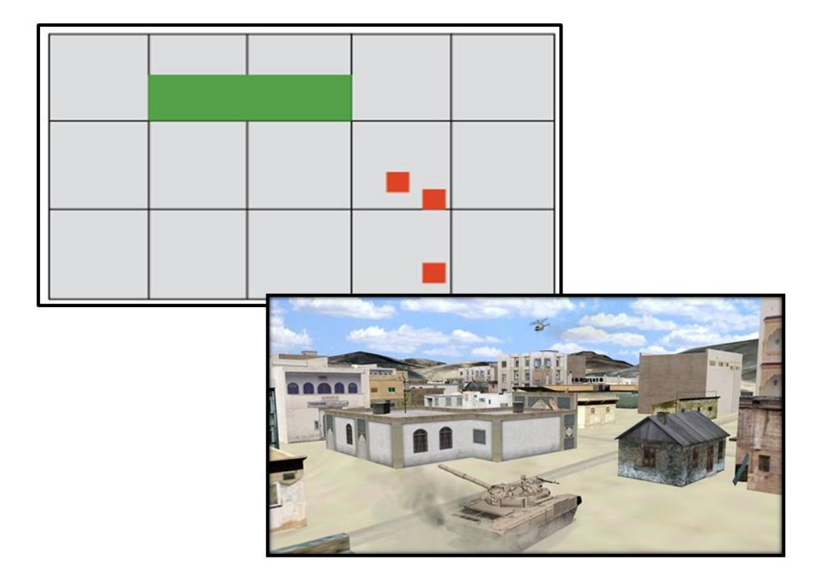
Figure 1: Comparing old and new representation of a tank

The need for a simulation to visually appeal and argue a directive clearly comes into play in the modern era. Consider Figure 1 for example, a red square is no longer an adequate representation of battle tank when compared to a highly rendered graphic, even though they both represent the same data. The function of simulation is of primary importance to its end result but it cannot be denied that the discipline of M&S now prizes fancy graphics to communicate. The underpinnings of visualization are deeply rooted in the power of an image to convey both quantitative and qualitative narrative structures as effectively as alphanumeric language systems. Is the visual clarity, organization, and visual understanding still secondary to the data? Are the form and the function so far removed from one another? It will be argued that the visualized form creates the narrative structure of the simulation, creating expectation and leading to bias.