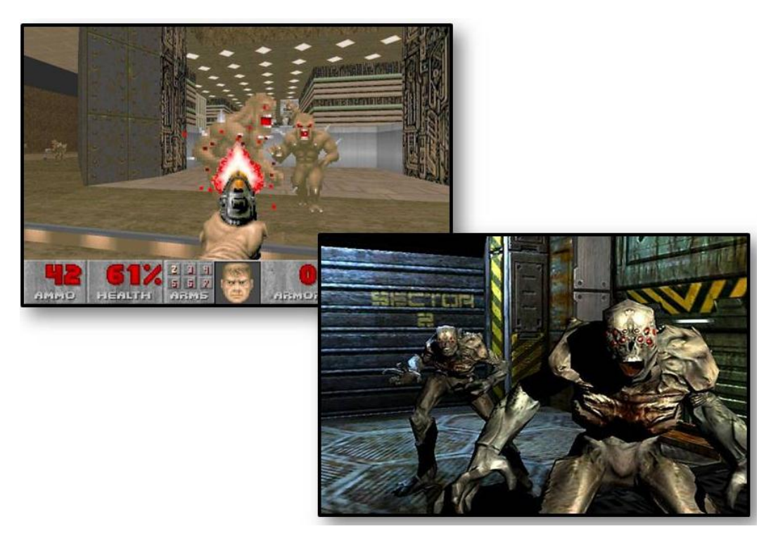
Figure 2: Screen-shots from the computer game Doom which show the advancement of computer graphics over the last 15 years

A computer simulation could simply be presented as a series of equations and tables but, even to those trained to read such things, this can be cumbersome and difficult to follow. By representing the different elements of simulation using visualization, we are able to gain a concise clarity of the simulation's purpose and function; this clarity can thus organized in our minds to give an understanding of the simulation's purpose and results. Achieving this clarity for the viewer is no simple task and the art of visualization is discussed at length by Edward Tufte (Tufte, 2001) and William Cleveland (Cleveland, 1993).