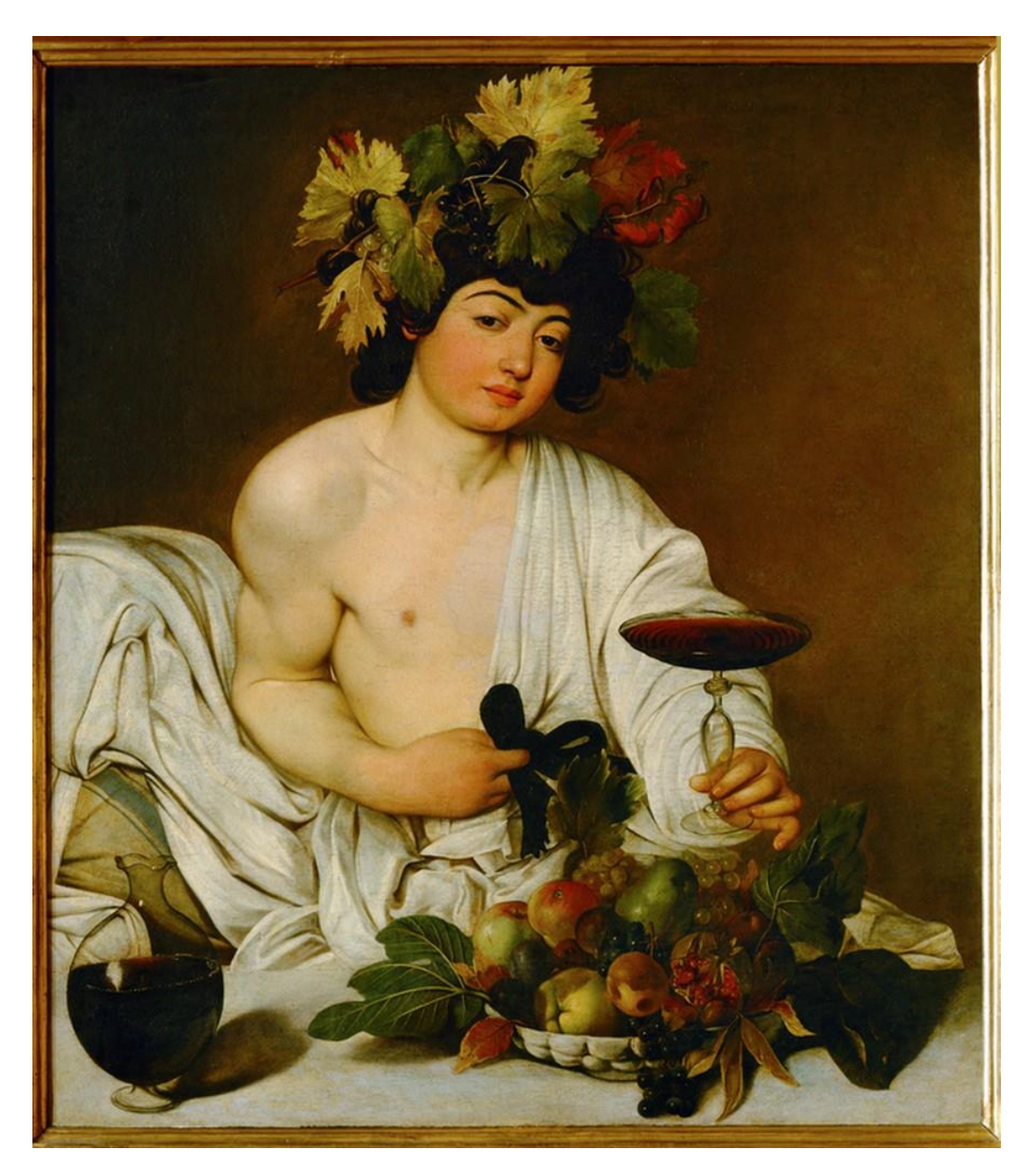
Fig. 3. Caravaggio, Bacchus,\,1597. Oil on canvas, 95 cm x 85 cm. Ufizi, Florence.