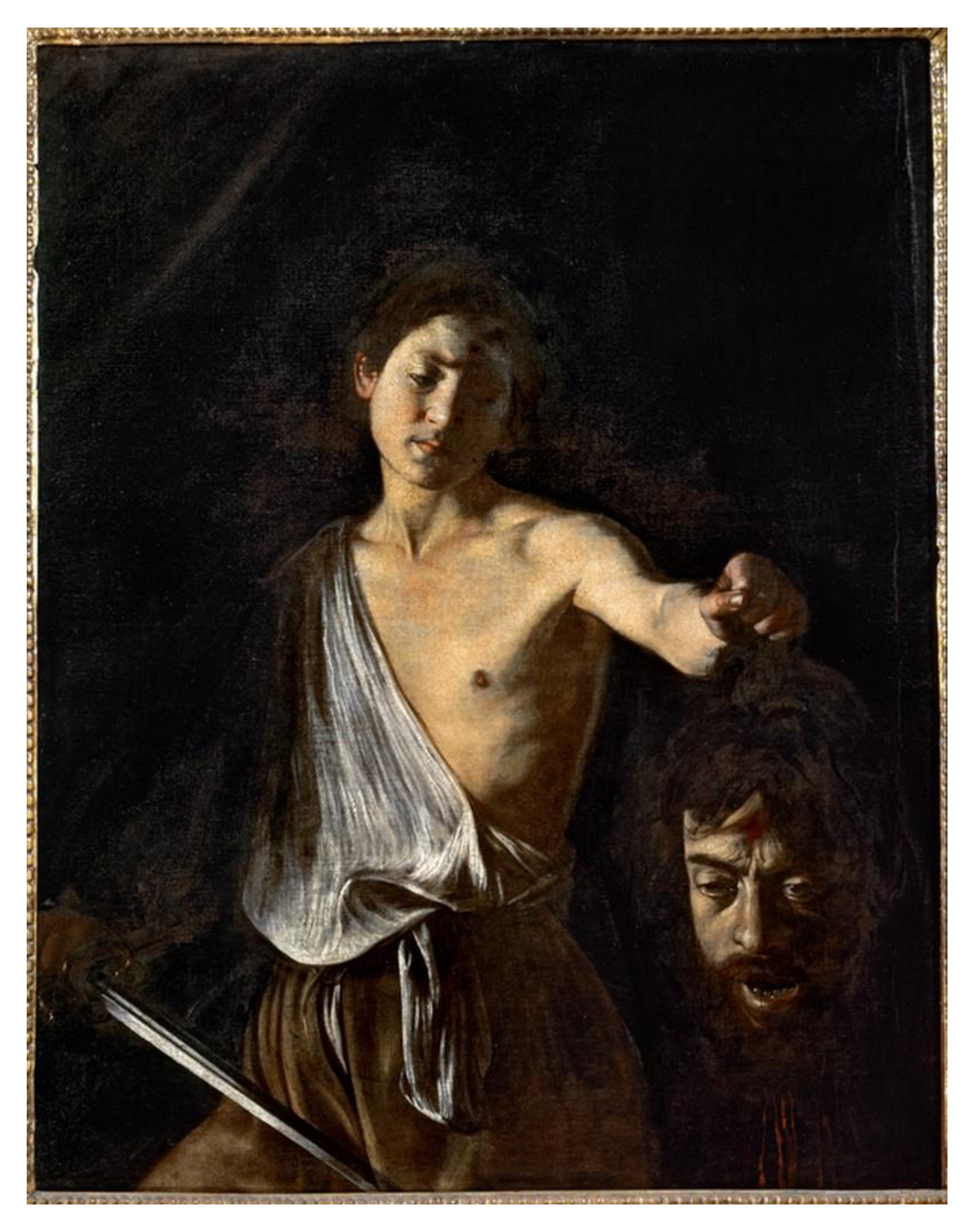
Fig. 5. Caravaggio, David with the Head of Goliath, 1610. Oil on canvas, 125 cm x 101 cm. Galleria Borghese, Rome.