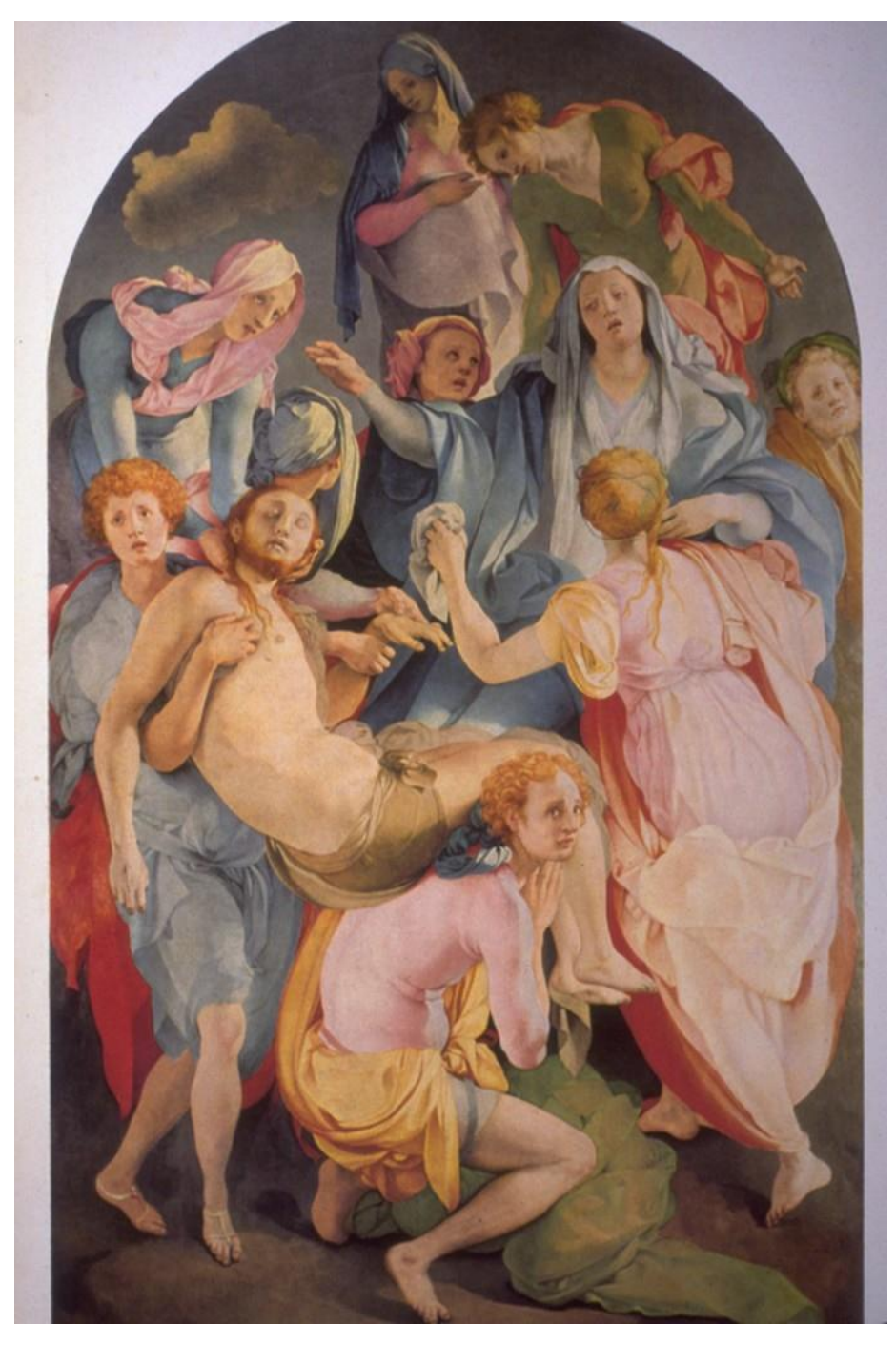
Fig. 2. Pontormo, Descent from the Cross , 1525. Oil on panel, 312 cm x 193 cm. Capponi Chapel, Santa Felicita, Florence.