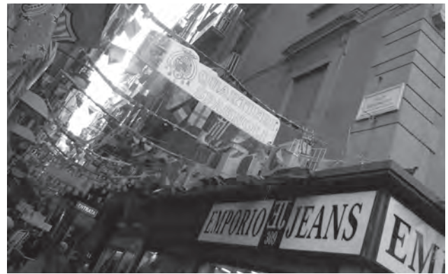
Vico Giardinetto, a pedestrian street in the Spanish Quarters of Naples today ( MapRef-13 )