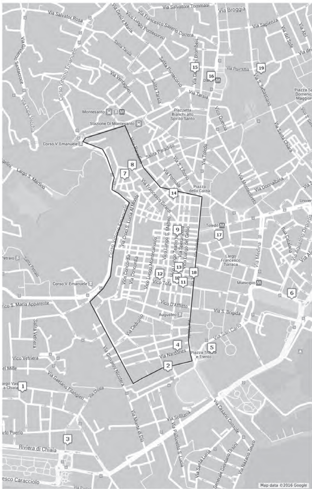
Figure 1: Naples today, with the Spanish Quarters outlined and specific locations numbered.