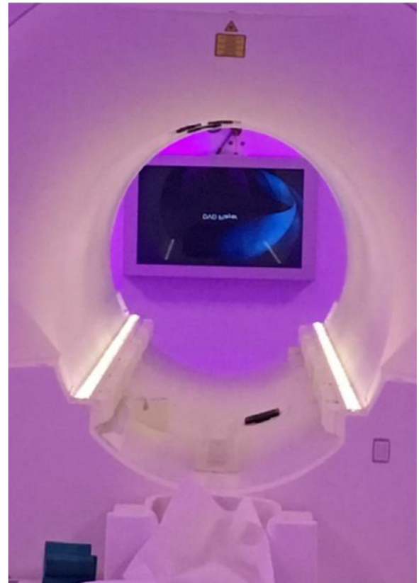
Fig. 1. Images depicting the use of film played on a screen within the scanning room [Image shared with permission, GOSH].

Another non-pharmacological approach is the use of melatonin, a natural sleep cycle regulator that can induce sleep in children [27] due to its mild sedative and hypnotic effect [28]. Pasini et al. [27] used 10 mg of melatonin added to a milk drink prior to the MRI in preschool children. This achieved adequate levels of sedation, allowing successful completion of the MRI scan in 14/15 patients. A recent retrospective study evaluated the efficacy of melatonin in 64 infants and young children in neuro-paediatric MRI. They found that 77% of scans were rated diagnostically acceptable by a paediatric neuroradiologist. However, only 22% of scans were free of movement artefacts in any sequence [28]. The increased success rates may be due to the sedative effect of melatonin rather than a sleep-inducing effect. Melatonin is a much safer option than sedation/GA as no studies reported adverse events or side effects [27,28]. Furthermore, it can be used in conjunction with the feed and wrap approach, if the infant wakes up during the scan as it is cost-effective, efficacious and can be administered in follow-up MRI scans, if required.