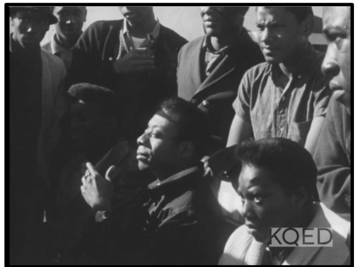
A still from the documentary film Take This Hammer (1963).

In his essay “Autobiographical Notes,” Baldwin mused, “About my interests: I don’t know if I have any, unless the morbid desire to own a sixteen millimeter camera and make experimental movies can be so classified.” 20 Although Baldwin was most famous for his writing, he also had a strong affinity for film, and he frequently appeared on camera throughout his career. In 1963, as the central