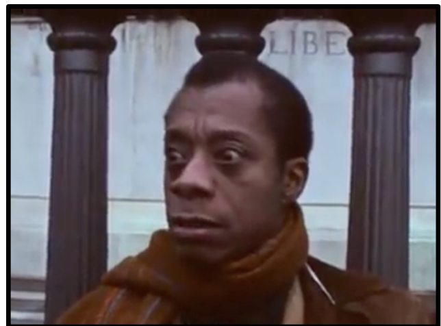
A still from the documentary film "Meeting the Man" (1970).

“Is that also why... you have veered this film off of your literary work?” Dixon demands, and Baldwin is taken aback, his eyebrows raised in concern. “What?” Dixon persists: “You have veered the film off your literary work and onto what you feel , rather than what you write.” Dixon is so fixated on the narrative he wants to present that he