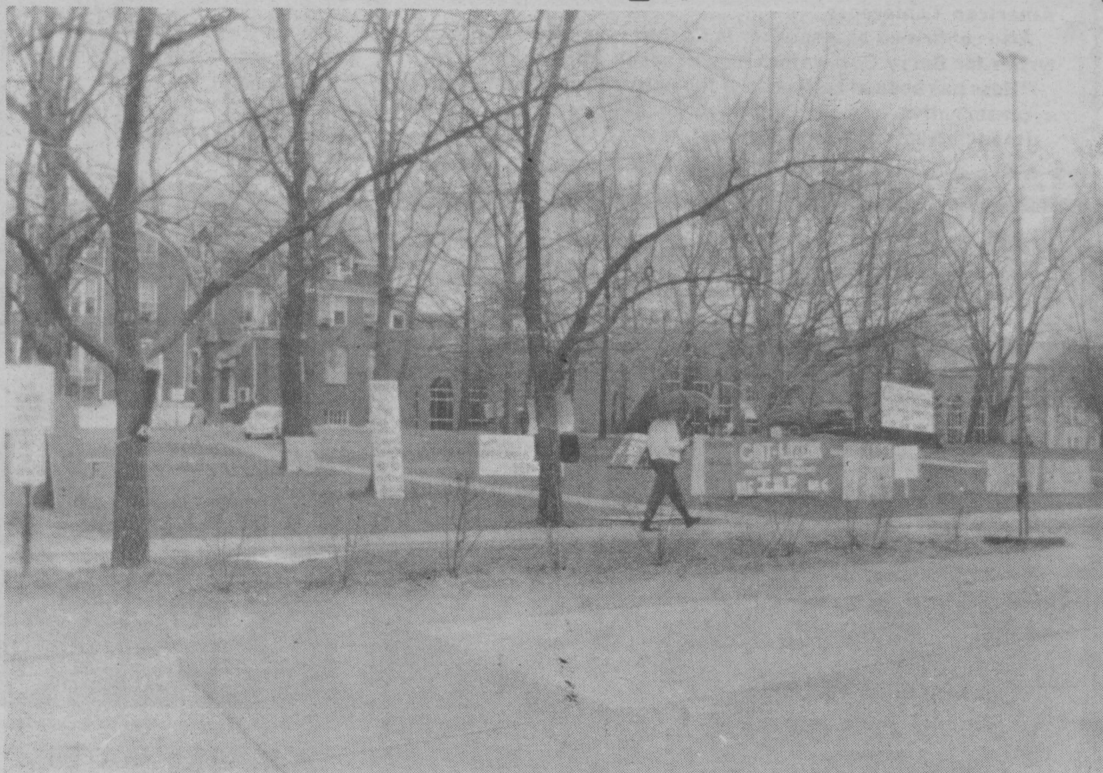
LONE STUDENT TRODS PAST CAMPAIGN SIGNS Student Government elections today